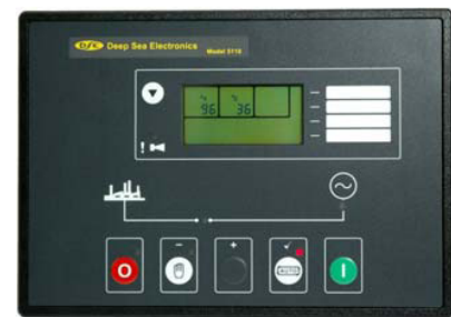
Control Panel By: