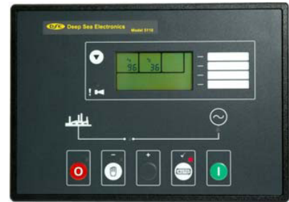
Control Panel By: