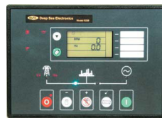
PLC-5220 Remote Control Panel