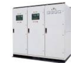
PLC-550 Parallel Control Panel system