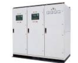
PLC-550 Parallel Control Panel system