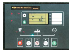
PLC-5220 Remote Control Panel