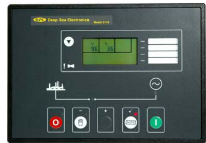
Control Panel By: