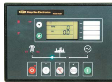
PLC-5220 Remote Control Panel