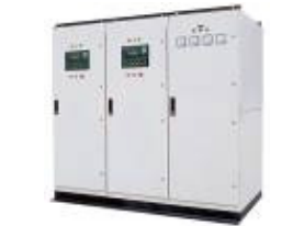
PLC-550 Parallel Control Panel system