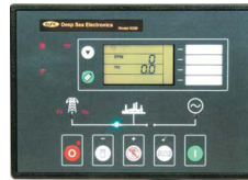
PLC-5220 Remote Control Panel